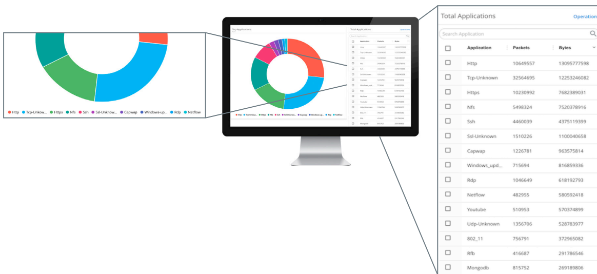
Figure 3: Gain visibility to the applications on your network

To see a demonstration and learn what Application Filtering Intelligence can do for you, contact Gigamon for more information at www.gigamon.com/contact-us .